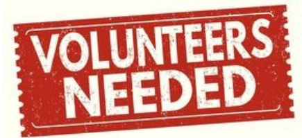
TABLE TO TABLE 25 TH ANNIVERSARY DINNER

TABLE TO TABLE IS IN NEED OF VOLUNTEERS to help with maintaining their mission of connecting abundance with need in Johnson County. They are incredibly flexible: whatever your schedule is, they can probably work with it! They have volunteers that come in twice a week and volunteers that come in twice a month and both are valuable to the organization. Duties can include: harvesting produce at farms and orchards, driving or riding in T2T vans on routes to pick up and deliver food, helping prep vans for their routes in our shop (move empty boxes around while listening to some tunes!), offering free fresh produce in at-need neighborhoods, and more. If your interest is piqued, check out their website ( table2table.org ), contact them at volunteer@table2table.org or at 319-337-3400.