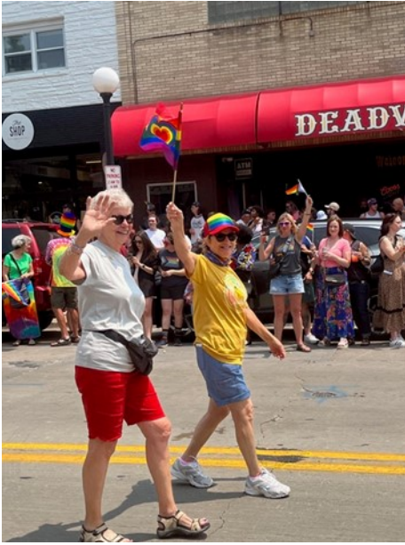
No deadwood in our group