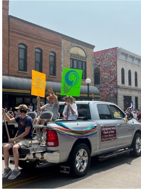
Here comes the truck!