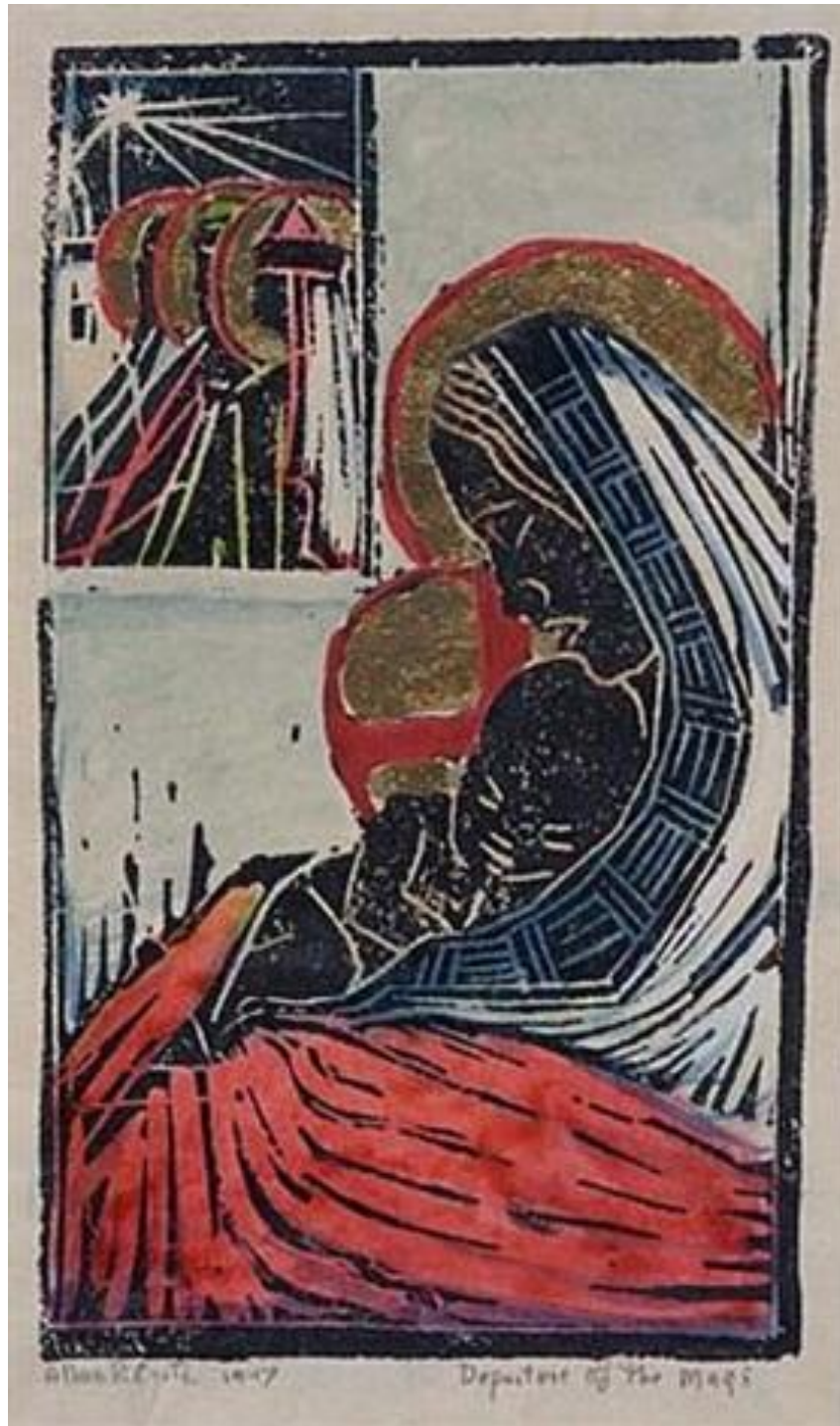
"Departure of the Magi"—Allan Crite

CONGREGATIONAL UNITED CHURCH OF CHRIST 30 N. CLINTON ST. IOWA CITY, IA 52245 319-337-4301